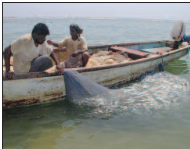
Fish are often the main food protein source for coastal communities, and clean produce is vital.

A further complication for food quality controllers is the fact that a seafood diet is inherently nutritious and rich in protein and vitamins. Restrictions on seafood intake can cause consumption patterns to shift towards less healthy diets. Seafood quality is also affected by other forms of contamination, such as heavy metals, algal toxins, pathogenic bacteria and viruses. The potential impact of an oil spill on public health must be viewed in a wider context in order to identify and implement appropriate remedies.