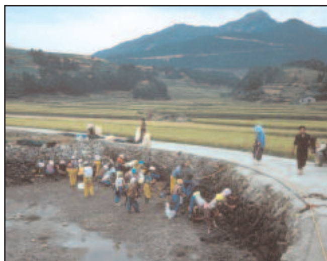
Fishing communities are often involved with clean-up during fishing bans or whilst fishing areas are oiled. This can help offset short-term financial hardship.

When it proves impossible to protect fishing gear and cultivation facilities from oil contamination, the choice becomes one of cleaning, repairing or replacing the affected item. In some situations compensation arrangements may exist allowing fishermen and aquaculture operators to be reimbursed for costs incurred and losses suffered. Claimants will be expected to provide evidence of the losses, such as receipts of payments made and records of income in previous years. However, in the case of subsistence fishing no financial transactions may be involved and catch records are unlikely to