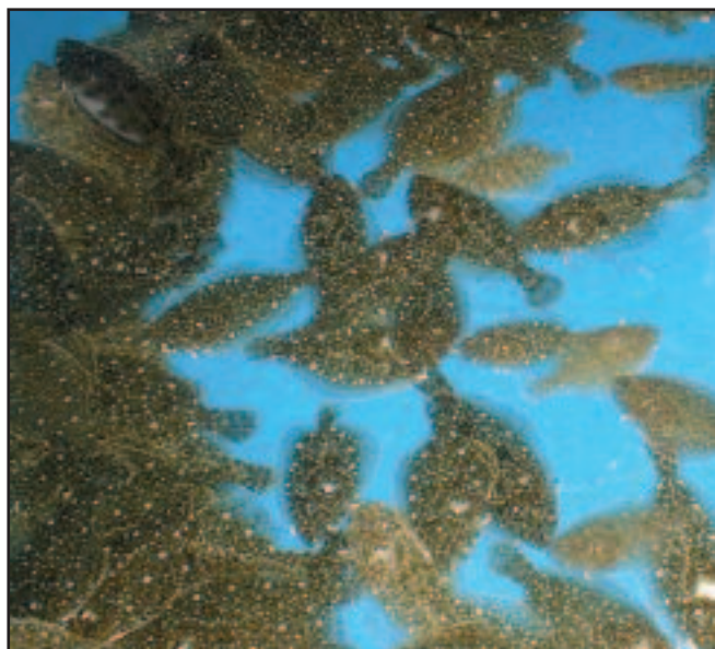
High stock densities are common in turbot farms, and water quality needs to be monitored carefully for metabolic wastes if sea water intakes are closed and water is recirculated.

Oil can foul the boats and gear used for catching and cultivating commercial species. Such oil contamination is then easily transferred to the catch. The handling of many