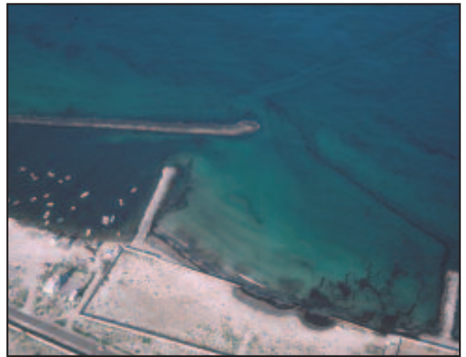
Oil in the vicinity of fishing ports or in fishing grounds can result in interruption of business.

In calm conditions fish farms can sometimes be protected with heavy-duty plastic sheeting wrapped around the perimeter of the cages, thereby preventing floating oil from entering the nets or contaminating the floats. The sheeting should not extend too far below the water surface and should be weighted at the bottom edge to prevent it from riding up as a result of weak currents or light wave action.