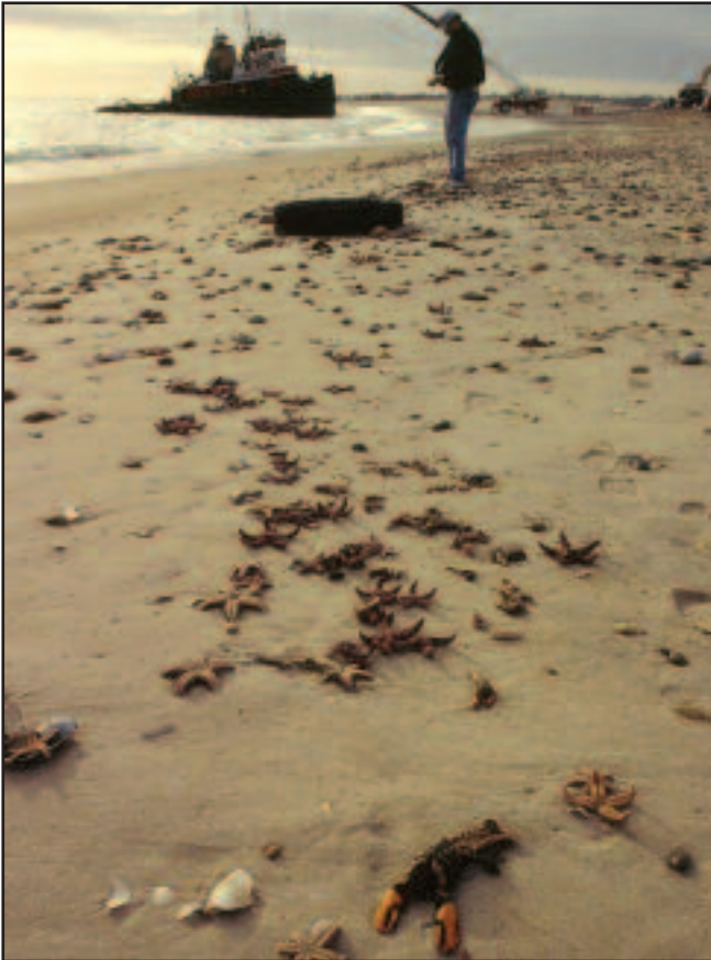
Lobsters, starfish and shellfish were killed by a diesel spill which dispersed naturally in shallow water during a storm.

When mariculture facilities and nets become contaminated, they can sometimes be cleaned in situ . When contamination is more severe, they may have to be dismantled for cleaning, and when impossible to clean they may have to be replaced.