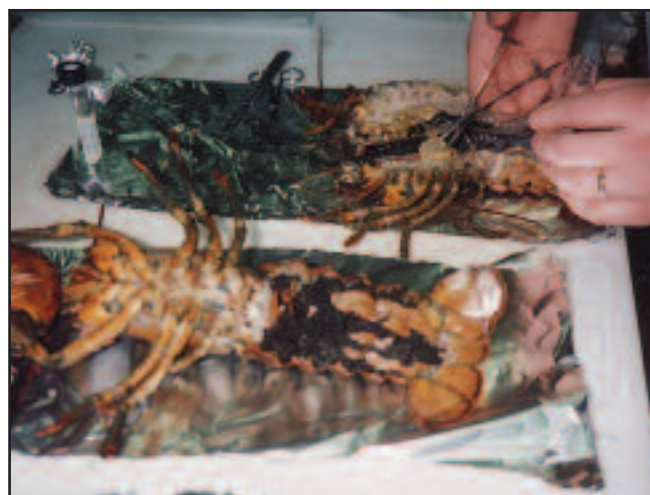
Fish and shellfish are usually steamed prior to sensory testing. Once cooked, these lobsters have been opened, and the digestive gland and white meat are tested for taint by smell and taste.

The taint-free threshold can be defined as the point where a representative number of samples from the polluted area are no more tainted than an equal number of samples from a nearby area or commercial outlet outside the spill zone. This