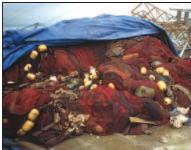
Oiled nets can be cleaned provided they are not too heavily fouled and the oil is not highly weathered and persistent.

seafood products in bulk means that it is seldom practical to locate and remove the oiled specimens. Flotation equipment, lift nets, cast nets, and fixed traps extending above the sea surface are more likely to become contaminated by floating oil, whereas lines, dredges, bottom trawls and the submerged parts of cultivation facilities are usually well protected, provided they are not lifted through an oily sea surface, or affected by sunken oil.