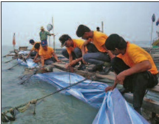
Plastic sheeting from a local supplier of building material is weighted and suspended around a fish cage.

Booms and other physical barriers can sometimes be used to protect fixed fishing gear and aquaculture facilities, although in most cases it is impossible to prevent damage altogether. Fishing and cultivation equipment is often purposely sited to benefit from migration routes or efficient water exchange. Such locations are characterised by fast water flow, which is where booms will not perform well.